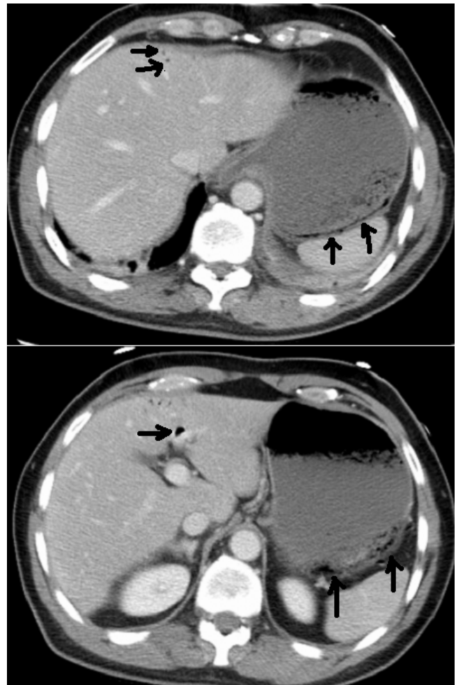
Figure 1 Portal gas within the liver secondary to partial necrosis of the gastric wall.

Respiratory tract infection, abdominal trauma, diagnostic and therapeutic gastrointestinal procedures, resuscitation procedures, drugs and caustics ingestion are rare causes for PVG, while it is idiopathic in certain cases [36-44] (see additional file 1).