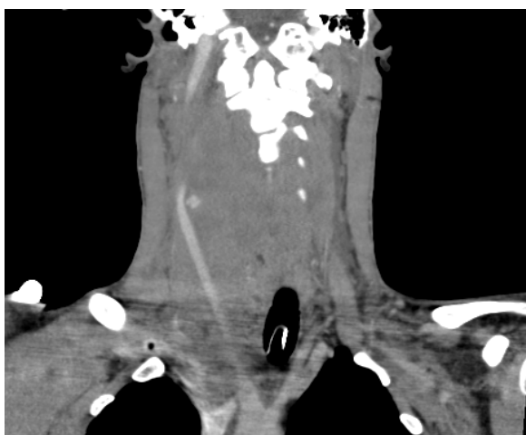
Figure 2 CT angiogram, coronal section showing active leak of contrast from the right common carotid artery. Note the marked displacement of airway to the left.

His neck was opened on the right side using a lazy S incision. On opening his platysma, there was a bulging haematoma which was rapidly expanding. Control of the Right common carotid was obtained proximally at the